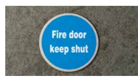
Fire door keep shut

Automatic Fire Door Keep Clear - Doors which are held open, or swing-free, but which revert to self-closing as soon as the fire alarm sounds - in corridors, a fire door can be a nuisance. Hold open devices which are connected to the fire alarm system are allowed, as long as they are properly maintained but They must revert to self-closing when the fire alarm sounds. One type of door closer allows the door to swing freely and easily in normal use, giving open access to the elderly and disabled. It reverts to self-closing when the fire alarm sounds.