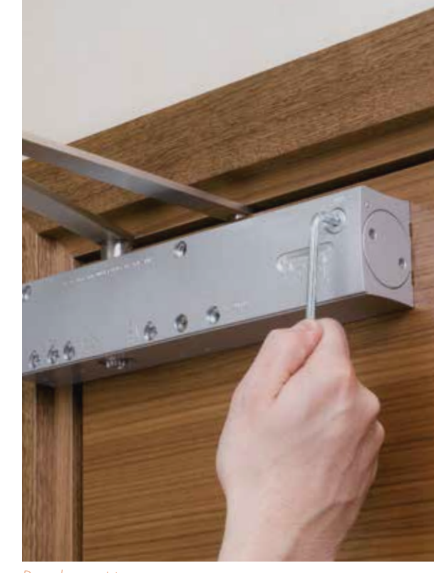
Door closer maintenance