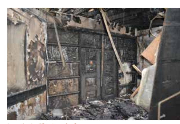
Internal side of fire door after fi