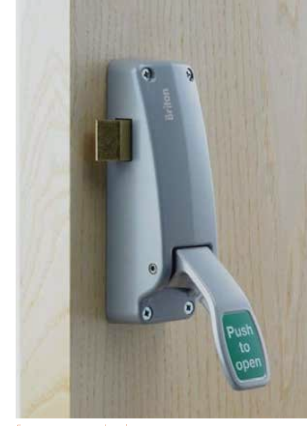
Emergency escape push pad

Other devices need very careful risk assessment as they are unlikely to comply with Regulations and product standards.