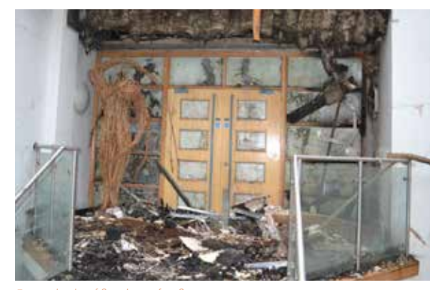
External side of fire door after fire

Fire doors must be installed to replicate their tested condition, and if you make any changes to them in any way, you are likely to negatively affect their fire performance, and certainly nullify any 3rd party certification or CE/UKCA mark.